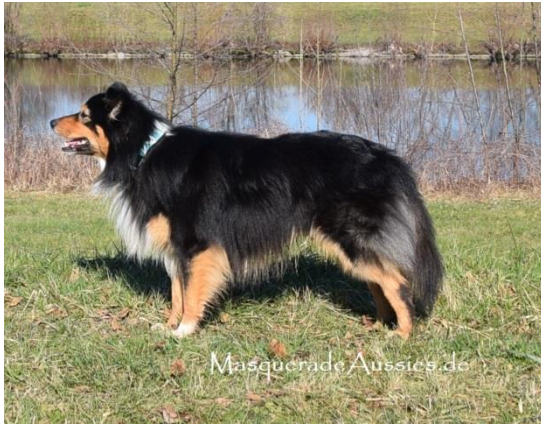
Masquerade Aussie de

ASCA RTCH Masquerade Date of Destiny DNA-VP ASCA ODX CDX UD GS-N RS-N RNX REX RMX REMX DNA-VP, VDH-BH, O2 (V), RO3, BHV-HFS 2, Dummy 2