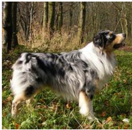
BPIB- Amsterdam winners show