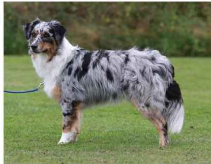
Multiple HIT and HC Rally and Obedience

RTCH OTCH-O Zestforlife Tiranog Masquerade DNA-VP ASCA CDX ODX UDX REX RMX REMX RTX GV-N VDH BH, O3, RO3; BHV HFS-2, Dummy 2