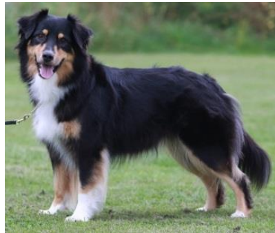
Multiple HIT and HC Rally and Obedience

RTCH OTCH-O Zestforlife Tiranog Masquerade DNA-VP ASCA CDX ODX UDX REX RMX REMX RTX GV-N VDH BH, O3, RO3; BHV HFS-2, Dummy 2